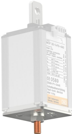
Mounting plate with threaded connector M10