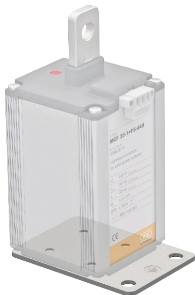
Mounting plate 1-pole